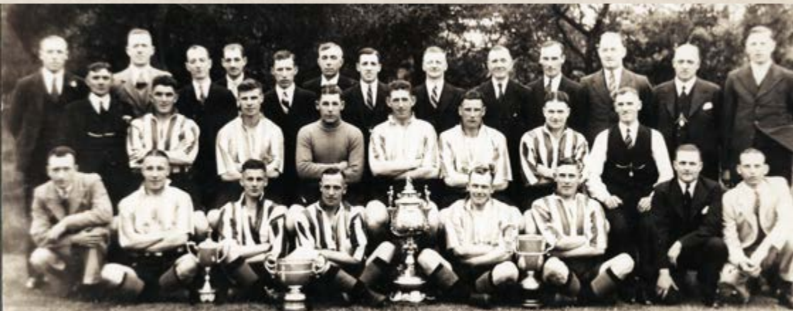
Blackhall Colliery Welfare Football Team, 1930's