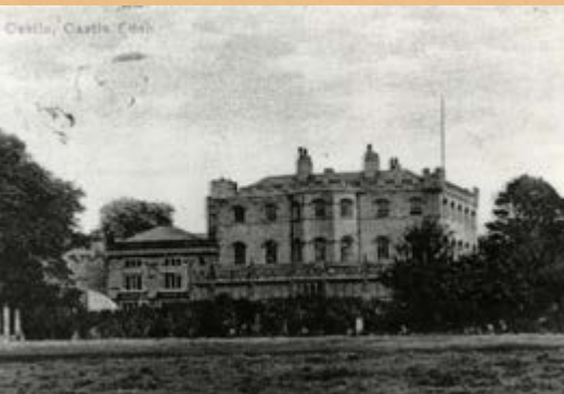
The Castle, Castle Eden