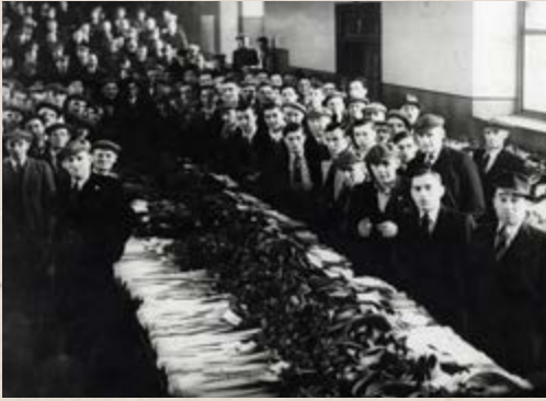
Leek show at a Workmens Club, 1945