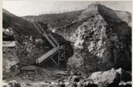
Blackhall Rocks, cliff steps