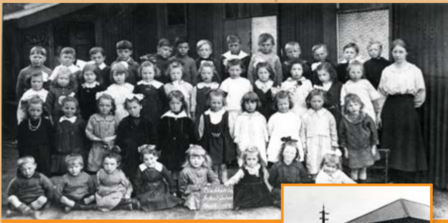
Tin School Colliery Infants, 1919