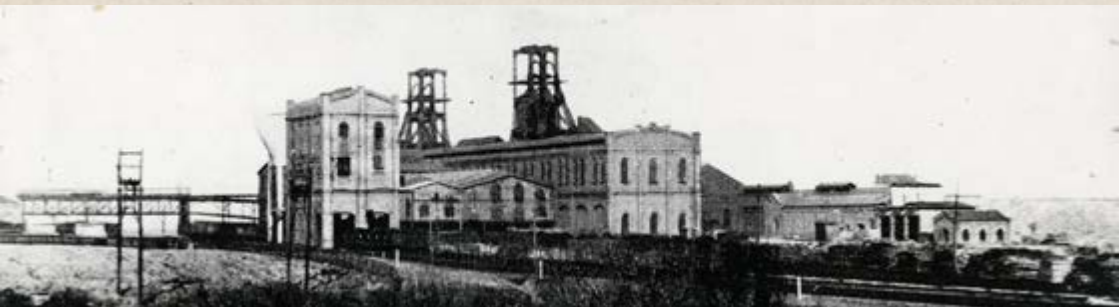
Blackhall Colliery Facing South, 1929

Mining in Blackhall goes back a lot longer than we thought. Back in the 18th century there was a lead mine in the area before coal mines were even around.