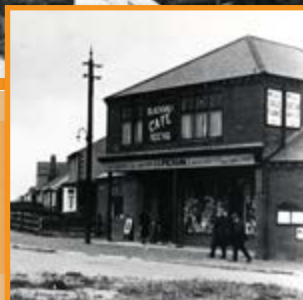
Pieronni's corner, 1928

In the colliery we used to have two cinemas, but back then they called them picture houses. At The Rocks we had an ice cream parlour called The Blackhall Rocks Café, it was ran by an Italian family called the Pieronni's.