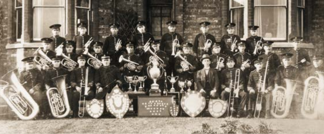
Blackhall Colliery Brass Band, 1930

Blackhall used to have a prize-winning brass band. The brass band was a big part of life in the colliery and the band would march to Durham with a banner each year. This still happens today and we still have a brass band, but mostly its young people who learn to play the instruments.