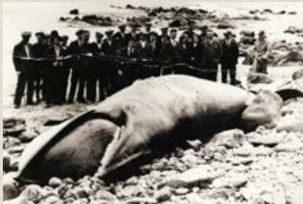
Whale washed up on Blackhall beach, 1938

The things that children wish they had today like cinemas and places to go swimming were the things that were here when the pits were open.